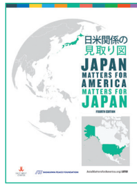
Japan Matters for America (2023)