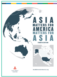
Asia Matters for America (2022 - 4 th edition)