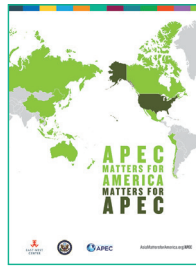
APEC Matters for America (2023)