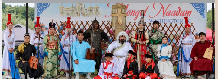
Artists in traditional costumes who performed at the Naadam Festival at Bull Run Park