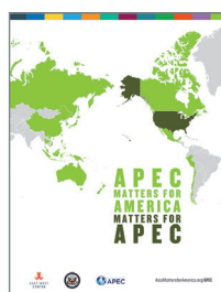
APEC Matters for America