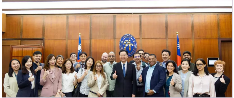
EWC Delegation Briefing with Taiwanese Foreign Minister Joseph Wu, April 17, 2024.