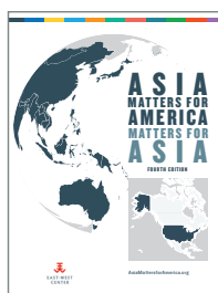
Asia Matters for America