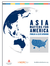
Asia Matters for America Public & Elite Opinion Poll (2022)

The Asia Matters for America (AMA) initiative maps the trade, investment, employment, business, diplomacy, security, and people-to-people connections between the United States and the Indo-Pacific at the national, state, and local levels. The publications, one-page connection summaries for states and congressional districts, and the website are resources for understanding the robust and dynamic US—Indo-Pacific relationship.