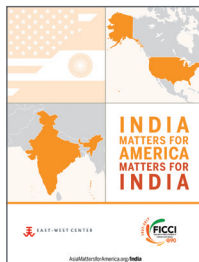
India Matters for America (2017)