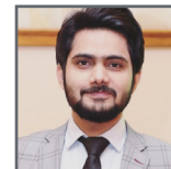
Riaz Khokhar Pakistan (2019)