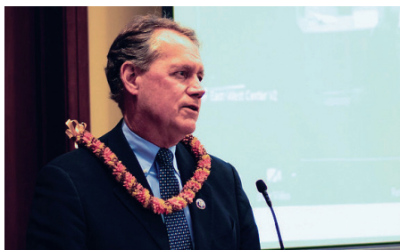
Rep. Ed Case addresses the audience at the the Pacific Islands Matter for America Launch on Capitol Hill