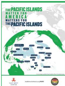
The Pacific Islands Matter for America

The Asia Matters for America (AMA) initiative maps the trade, investment, employment, business, diplomacy, security, and people-to-people connections between the United States and the Indo-Pacific at the national, state, and local levels. The publications, one-page connection summaries for states and congressional districts, and the website are resources for understanding the robust and dynamic US—Indo-Pacific relationship.