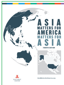
Asia Matters for America