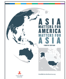
Asia Matters for America