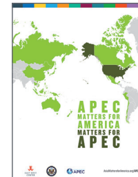
APEC Matters for America