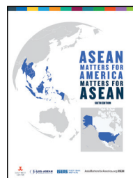
ASEAN Matters for America