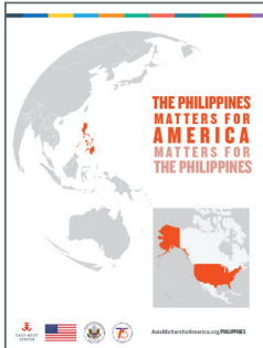
The Philippines Matters for America

This initiative maps the trade, investment, employment, business, diplomacy, security, education, tourism, and people-to-people connections between the United States and the Indo-Pacific at the national, state, and local levels. This website, publication, and one-page summaries for states and congressional districts are resources for understanding the robust and dynamic US-Indo-Pacific relationship.