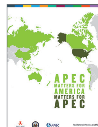
APEC Matters for America