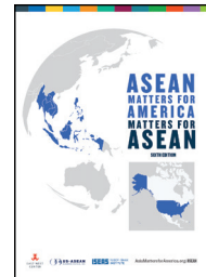
ASEAN Matters for America