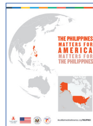
The Philippines Matters for America