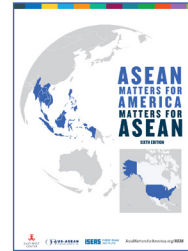
ASEAN Matters for America

The Asia Matters for America (AMA) initiative maps the trade, investment, employment, business, diplomacy, security, and people-to-people connections between the United States and the Indo-Pacific at the national, state, and local levels. The publications, one-page connection summaries for states and congressional districts, and the website are resources for understanding the robust and dynamic US-Indo-Pacific relationship.