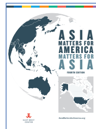
Asia Matters for America