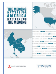
The Mekong Matters for America