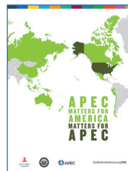
APEC Matters for America